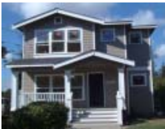
Before & after photos of one of the Seattle homes featured on the tour

The Remodeled Homes Tour will feature 25 quality projects from area builders and remodelers. The homes are located in Bellevue, Seattle, Mercer Island, Redmond, Kirkland, Issaquah, Sammamish, Woodinville, Newcastle, Medina and Yarrow Point. Tour participants are given addresses of the homes and a map.