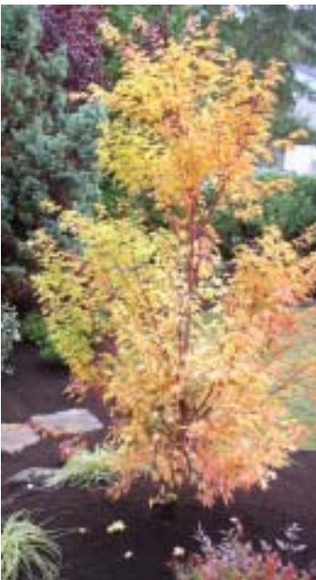
Year-round color interest makes the Coral Bark Maple one of the ideal trees to give as a gift.

A tree is a thoughtful gift that provides the recipient with years of enjoyment. In addition to holiday gifts, trees can also be a special way to mark the birth of a child or to memorialize a lost loved one.