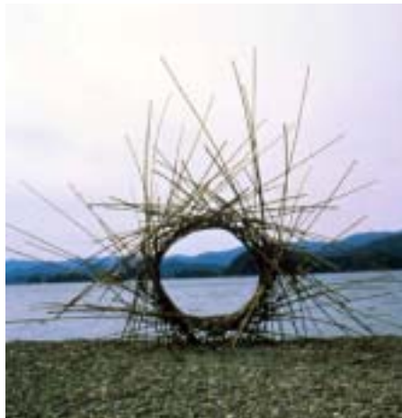
Andy Goldsworthy creates large-scale art installations using materials from nature

made of natural materials such as leaves, stones, and twigs, as well as large-scale photographs that document similar sculptures created by British artist Andy Goldsworthy during his visit to Japan in 1987. Goldsworthy, a highly regarded artist with large-scale commissions throughout the world, relies on the cyclical rhythms of nature to create distinctive works. His art, though sometimes temporary, transforms landscapes into unexpected works of art.