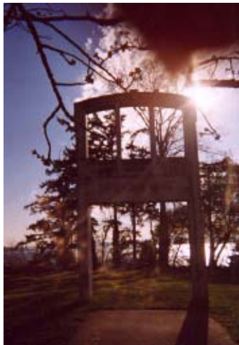
Waverly Site Park in Kirkland