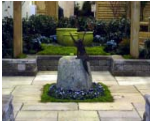
Lifestyle Landscape's display on Idea Street at the 2003 Seattle Home Show

Home shows offer a great opportunity to focus on beautifying your indoor and outdoor living space. Get inspired at these upcoming area events: